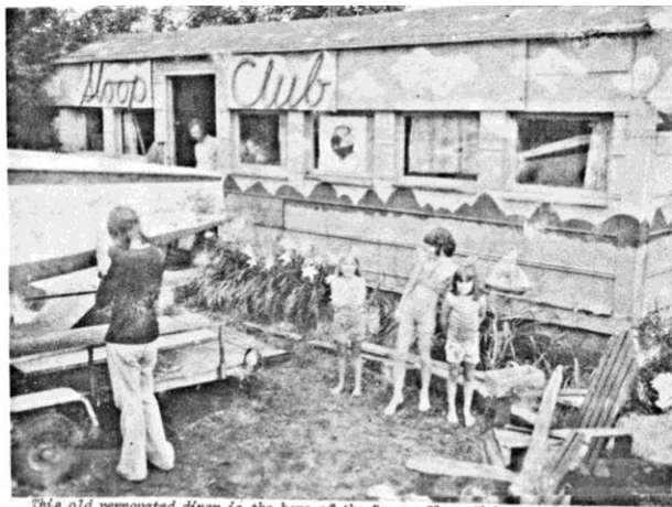
This old renovated diner is the home of the Beacon Sloop Club. Here sloopers gather weekly to work on club projects and monthly for a social and business meeting. The only sloop club to have its own building to use, this picturesquely painted diner is owned by the City of Beacon, is heated by a wood-burning stove in winter and should boast a Clivus Maltren someday.

The house version of this bill contains $10 million for Orange County and $10 million for Dutchess County sponsored by Pat Ryan, along with significant funding for other Hudson and Mohawk Rivers watershed projects, including sewer infrastructure, flood reduction projects, invasive species management, and safe drinking water. The current Senate version of the bill does not have these provisions. Both houses of Congress are in the process of negotiating to create a final version of the authorization bill.