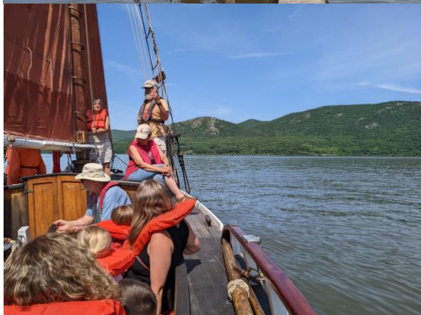
Cornwall