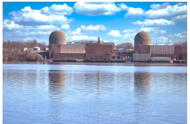
Counting down to closure

NEXT EXEC. COM. MEETING Tuesday, April 27, 6:00 p.m.