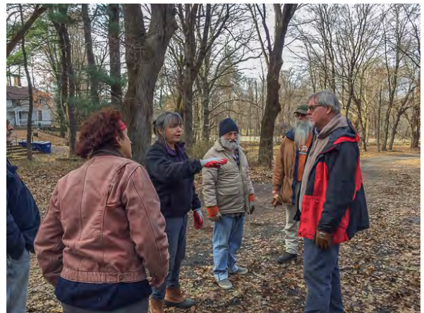
Volunteers preparing our new space