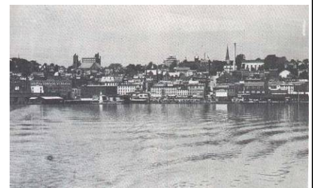
Newburgh waterfront in 1965