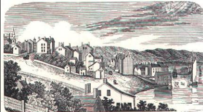
Newburgh in 1820

They put on quite an amazing show of the evolution of the area from pristine wilderness, through the industrial era, and on up to the present day.